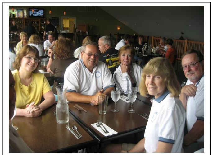
PENNS CAVE CRUISE