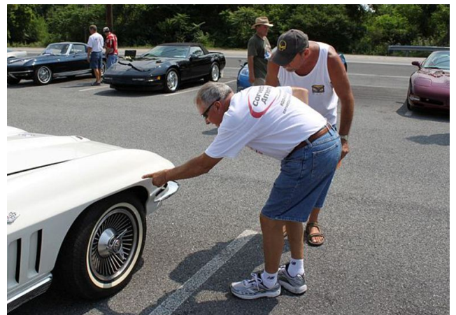
Right There! Two Points-Fly Dandruff!