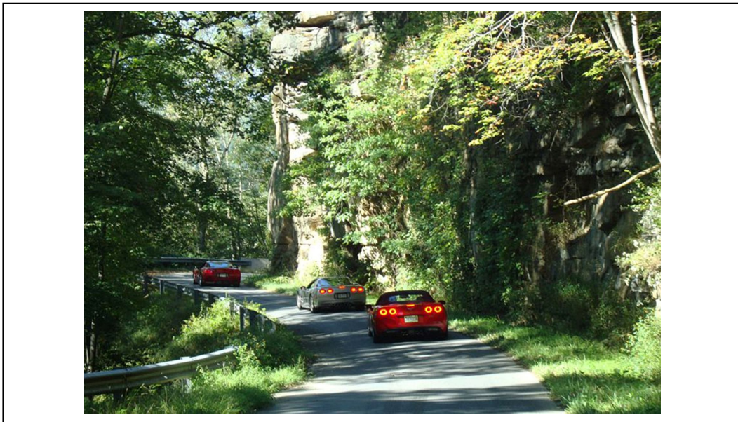
Grape Stomping Cruise to the Kirkwood Winery and New River Gorge. September 2010