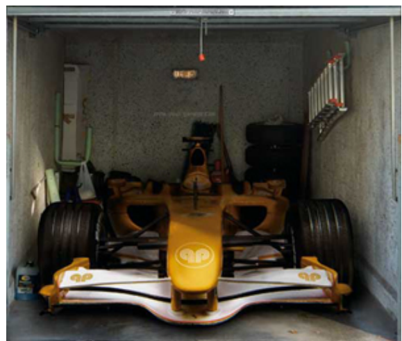
GARAGE DOOR COVERS http://www.style-your-garage.com/